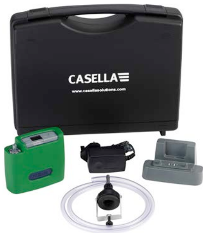
The Flow Detective™ is available as a kit with a sturdy carry case